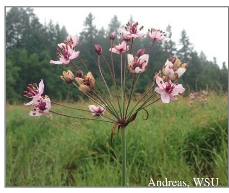
Flowering rush in bloom at a pond in western Washington.

Flowering rush, Butomus umbellatus L., is an aggressive invasive plant that rapidly colonizes freshwater aquatic systems. It is becoming an increasing concern in many North American states and provinces and is poised to become a substantial problem in several major waterways, despite ongoing eradication efforts. With both emergent and submersed growth forms, flowering rush can create dense stands and dominate from the shoreline to depths of 20 feet. Through rhizome fragments and rhizome buds, it can quickly disperse and colonize new areas with the assistance of water movement. Flowering rush is considered an ecosystem engineer for its ability to alter habitats by sediment accretion. It affects irrigation and dam power