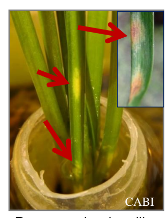
Doassansia niesslii tissue damage.

Results of the overseas work to explore biological control for flowering rush look very promising. A petition for field release of the first biocontrol agent, Bagous nodulosus , is expected to be submitted soon. If you are interested in receiving information about the project, contact <code>jandreas@wsu.edu</code> to join our listserv.