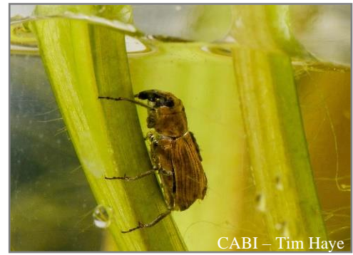
Bagous nodulosus resting underwater on flowering rush.

to nontarget test plant species to determine if they will consider it suitable for egg-laying) were conducted in 2014-2018 on 45 test plant species to ensure non-target species are not at risk. With only one incidence of an egg being laid on a European species, Baldellia ranunculoides , it appears that the beetle is highly host-specific. Given the mobility of the larval stage, no-choice larval establishment tests were conducted in 2018 and 2019 to assess acceptance of nontarget species. Limited larval feeding was only observed on two species so far; Hydrocharis morsus-ranae (native to Europe) and Limnobium laevigatum (native to South America). Host-specificity tests are expected to be completed in 2020. In addition, studies are underway to assess the weevil's impact on flowering rush.