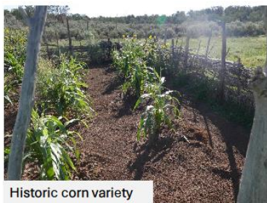
Historic corn variety