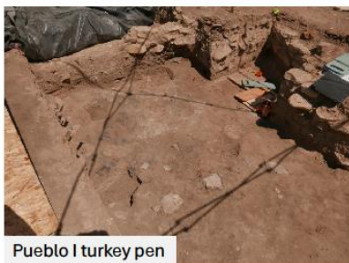
Pueblo I turkey pen