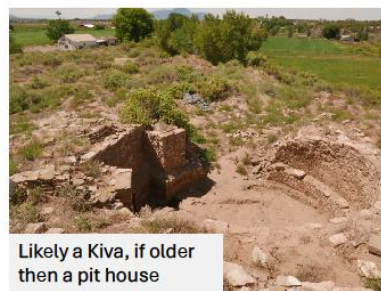
Likely a Kiva, if older than a pit house